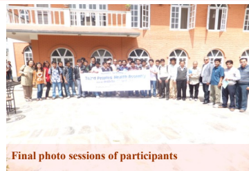
Final photo sessions of participants

are aware the slogan of Health For All is only limited in the words, so the main way-out of attaining health for all is to create awareness among people. He stated that the main aim during the establishment of WHO during 1945 was to achieve highest possible health care for everybody. Which was later strategically explained by Alma-Ata Conference being target oriented i.e. Health For All by 2000 but the donors directly or indirectly molded it to fund oriented and made it unsuccessful. he focused that health care is not just the curative part , the preventive and promotive is also of great importance so the investment in the research and technological field should be increased by all the nation replacing the private empire from the health or else HFA will just be a theme. He said that development model should