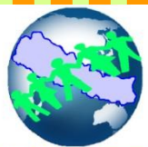
People's Health Movement Nepal - Students' Circle

With the vision to encompass all the interested individuals in people's health movement activism, PHM Nepal Students Circle has been doing alliance and networking with students and professionals from different fields.PHM Nepal Students Circle is based in volunteerism and does not entertain any material benefits.PHM Nepal Students Circle welcomes all the individuals into its alliance and networks to develop better force to raise PHM agendas.